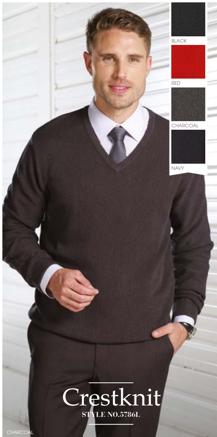
Crestknit STYLE NO.5786L