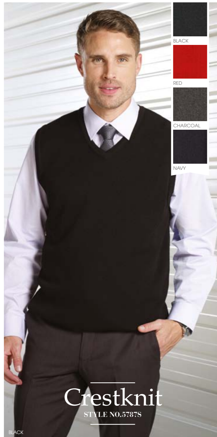
Crestknit STYLE NO.5787S